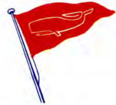
LAHAINA YACHT CLUB