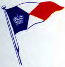
ROYAL VANCOUVER YACHT CLUB